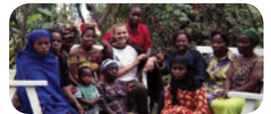
Ephaphtha School for Deaf Children Democratic Republic of Congo (2003)